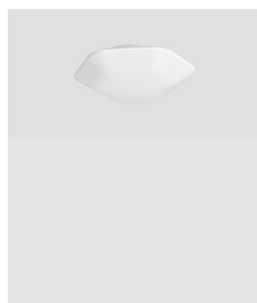
MODUL PP G